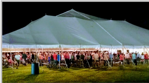
Hundreds hear the message