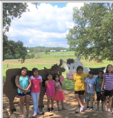
Fun on the Farm and Stories from the Word